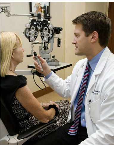
UCLA's Stein Eye Institute is a world-renowned center dedicated to the preservation of vision and the prevention of blindness.